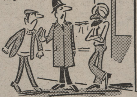
"Making remarks like, 'What did you think of the first Test then?' does NOT help community relations."