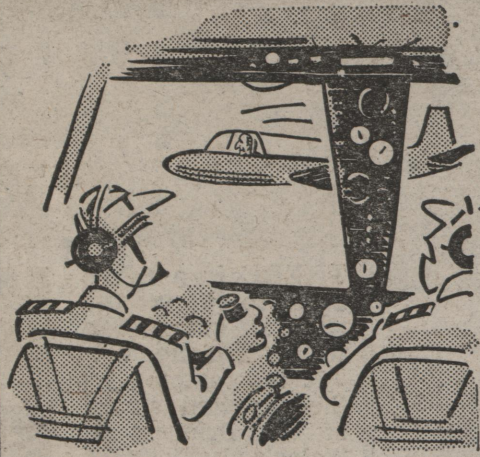
"Pull your finger out! Sir!"